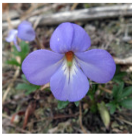
Bird's foot violet (Viola pedata) • Attracts bees and butterflies • Blooms in spring to early summer