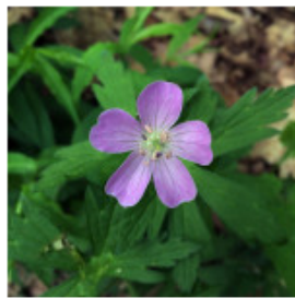
Wild geranium (Geranium maculatum) • Attracts bees and is especially good at attracting bumblebees—especially spring queens • Blooms in spring to early summer