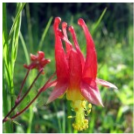
Wild columbine (Aquilegia canadensis) • Attracts hummingbirds and butterflies • Blooms in spring