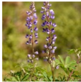
Wild lupine (Lupinus perennis) • Attracts bees and butterflies • Blooms in spring to early summer