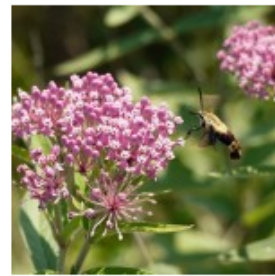
Smooth swamp-milkweed (Asclepias incarnata) • Attracts bumblebees, insects, and butterflies, and is a host plant for the monarch butterfly • Blooms in summer and early fall